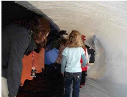
Students explore a life-size inflatable whale.