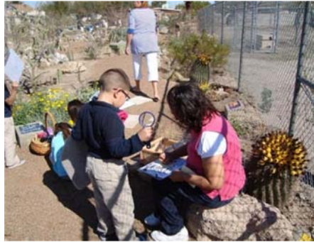
Manzo Elementary students working in their native Sonoran Desert Biome

In Tucson, Ariz., Manzo Elementary School is achieving notable success for designing a curriculum around reconciliation ecology. Reconciliation ecology is the science of inventing and establishing new habitats to conserve species diversity in places people occupy. At Manzo Elementary, students participate in hands-on activities that explore horticulture and reconciliation ecology. The results of these activities produce an added aesthetic charm to the school and neighboring community while simultaneously helping the surrounding environment and native species.