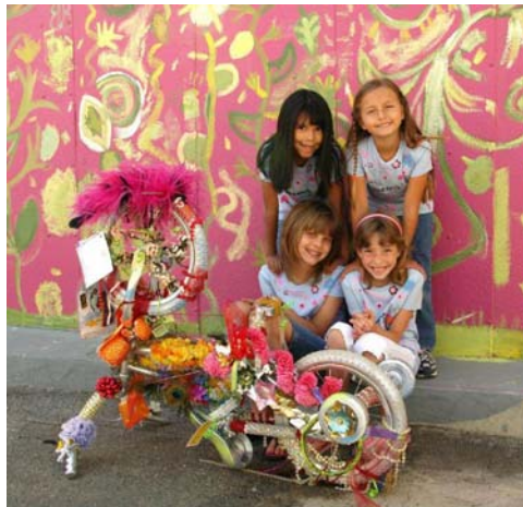
Recycle Bicycle , EE Week 2009 Photo Blog Contest winner

Do you have an inspiring story of how you and your organization are bringing environmental education to students? National Environmental Education Week would like to hear about it! Simply upload your photos and stories to the EE Week Photo Blog. Your story can be about activities either inside or outside the classroom, before, during or after EE Week.